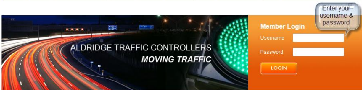
Figure 1 ATC Website Member Login Window

The password will be issued by ATC individually via an email. If you don't have a login account with ATC, simply email the site administrator: sysadmin@atc4.com.au