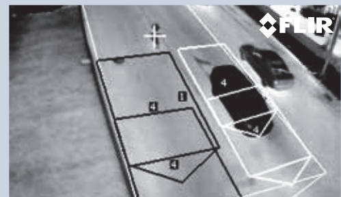
Bike and vehicle detection